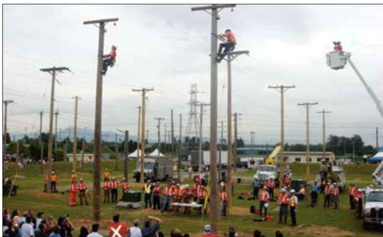
2008 Safety Rodeo Competitions