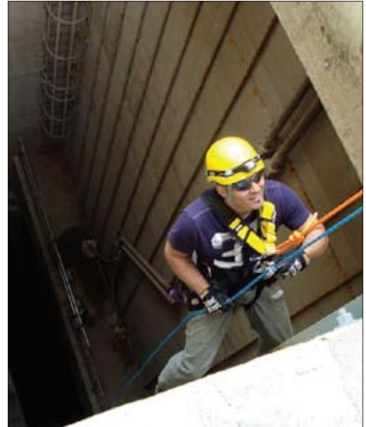
Safety at work displays: Inspection of Peace Canyon Intake Tower